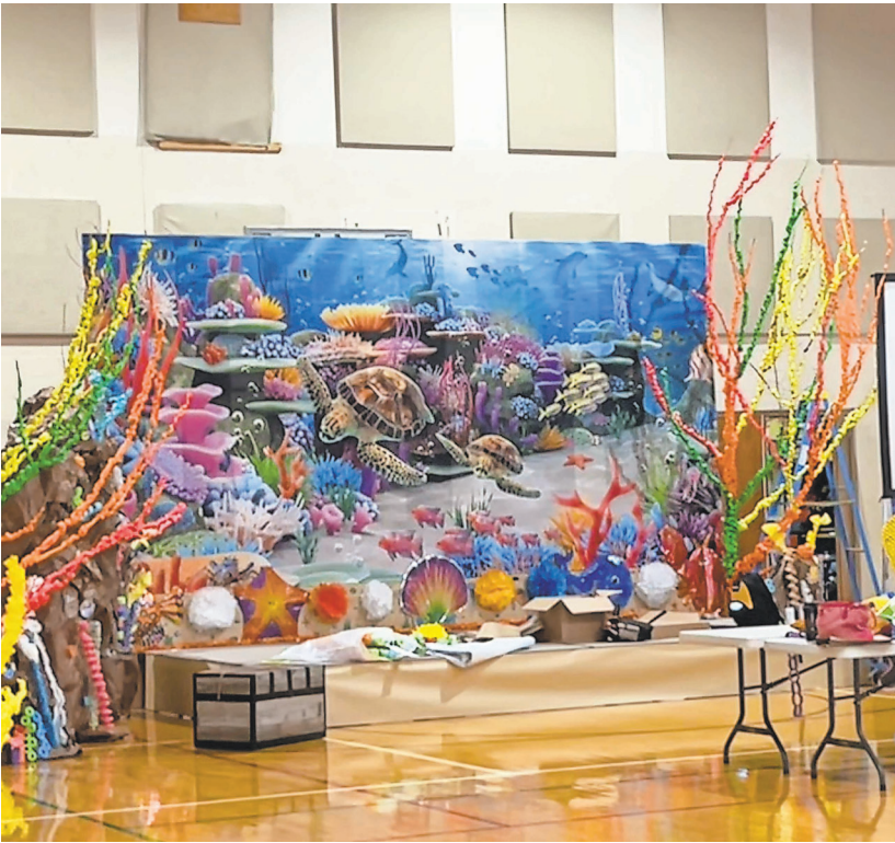
El Dorado First Baptist Church volunteer have been hard at work decorating in preparation for Scuba VBS.

El Dorado First Baptist Church, located at 315 W. Central Ave., is holding their Scuba Vacation Bible School (VBS) July 8 -12, from 9:00 AM to 12:00 PM. Scuba VBS will take kids on an undersea adventure designed to immerse them in the Word of God, helping them understand the true meaning of “living water.” Children from kindergarten through middle school are invited to join and dive deep into their friendship with God. They will enjoy a variety of activities, including snacks, games, crafts, and lessons from the Bible. To register for Scuba VBS, visit the First Baptist Church El Dorado’s website at https://www.edfbc.com/VBS .