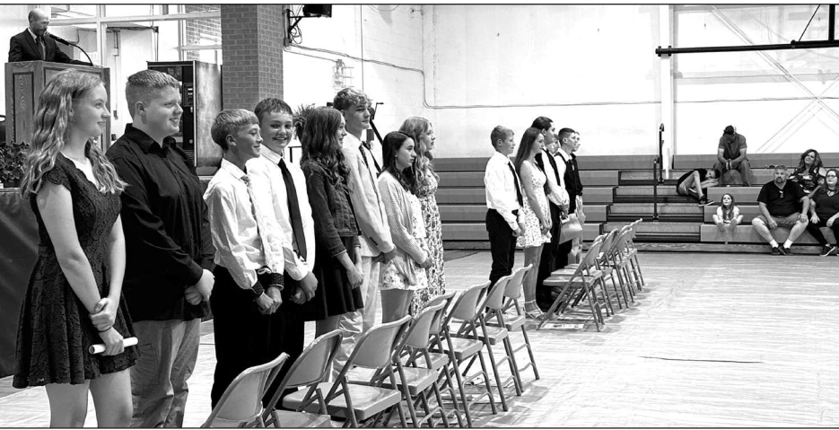
The eighth grade class was presented to the audience during the Promotion ceremony held May 12.