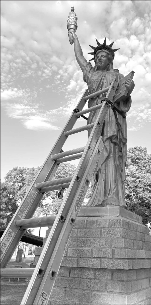
Fixing the damage required a ladder since the statue couldn't be brought down to ground-level.