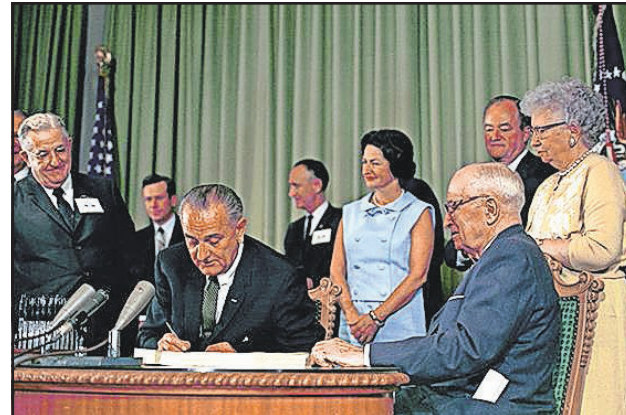
On July 30, 1965, President Lyndon B. Johnson signed Medicaid and Medicare into law as part of the Social Security Amendments.

In that moment, our country took a historic step toward ensuring that health care was more accessible for all citizens. Since then, Medicaid has transformed health care in America by providing coverage to millions of children, seniors, people with disabilities, and low-income families. It’s helped families stay financially stable, supported rural hospitals and clinics, and given people access to preventive care and life-saving treatment.