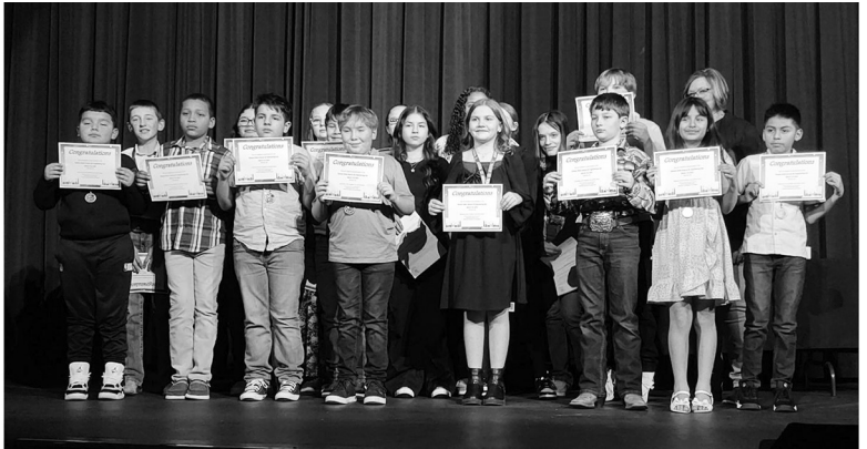
Rolla's students pose with their awards after the presentation.