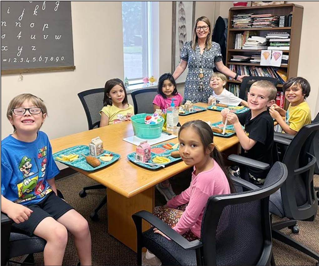
Congratulations to these 1st graders for earning 20 AR points!