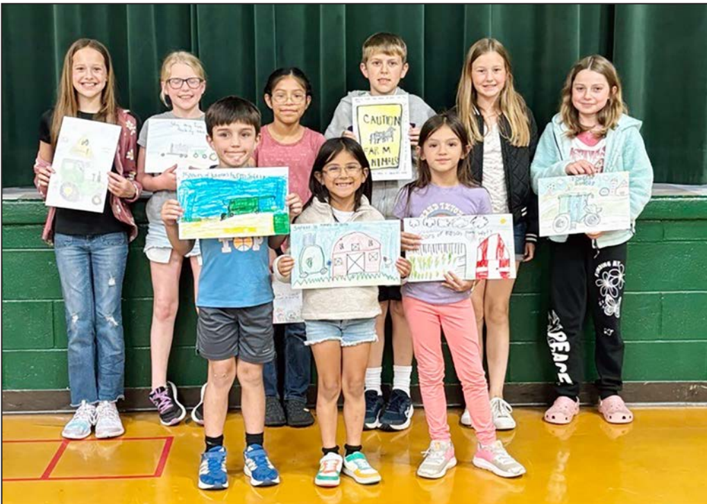
Congratulations to our safety poster contest winners. Thank you to Haskell County Farm Bureau for sponsoring this contest!