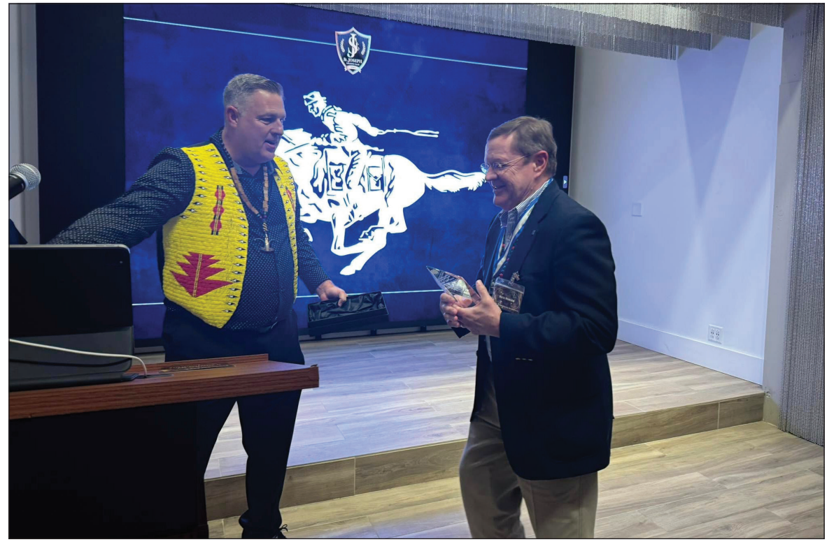
Scouting America Pony Express Council | Facebook

The evening's program mixed in video presentations, the handing out of newly designated awards, and special recognitions for attendees at all levels of the organization. Also introduced to the audience were new logos and branding for Camp Geiger and the Council's youth recruitment campaign.