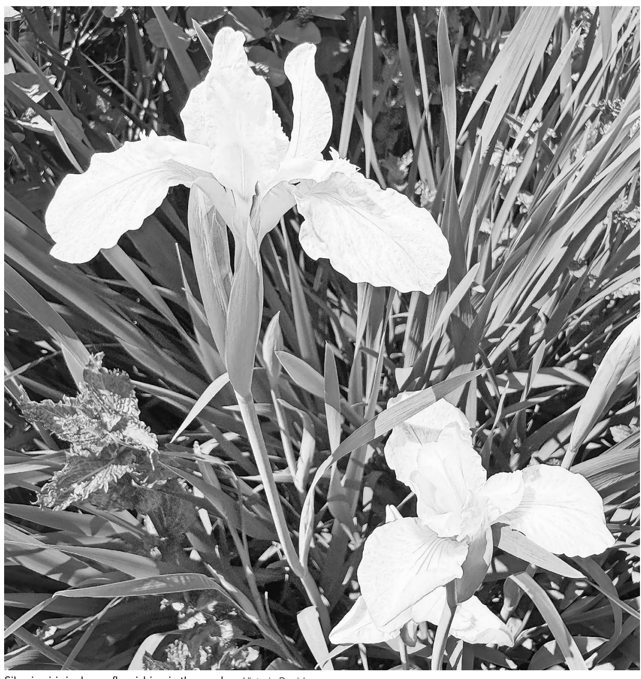
Siberian iris is shown flourishing in the garden. Victoria Davids