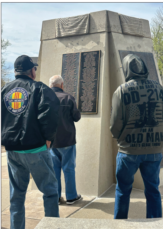
Area veterans examine the new names added to the Pottawatomie County Veterans Memorial. A new plaque is installed each time 50 names are collected.

explained. “Removal of a tube under an asphalt road is very hard. No matter how good of a compaction job you do, you will always have settling. Along with that, any time you tear up that road you are going to have downtime, which means the road is going to be closed. When we initially did the numbers three years ago, and we compared what the cost would be for us to remove that tube, put a new tube in, compact it, patch it with asphalt, and then come back typically one to two years later and patch again, the cost was almost the same. Within a thousand dollars of being the same.” Eisenbarth went on to explain the benefits of using the UV light cured process. “There’s no interruption to traffic throughout the whole process. Longevity wise, there is 75 to 100 years on this product,” he said. “Your price is going to range somewhere from $400 to $900 a foot.” Eisenbarth also stressed that simply replacing the tube may last 25 years and would result in repeated road patching. Whereas, the cured lining would last up to four times as long,