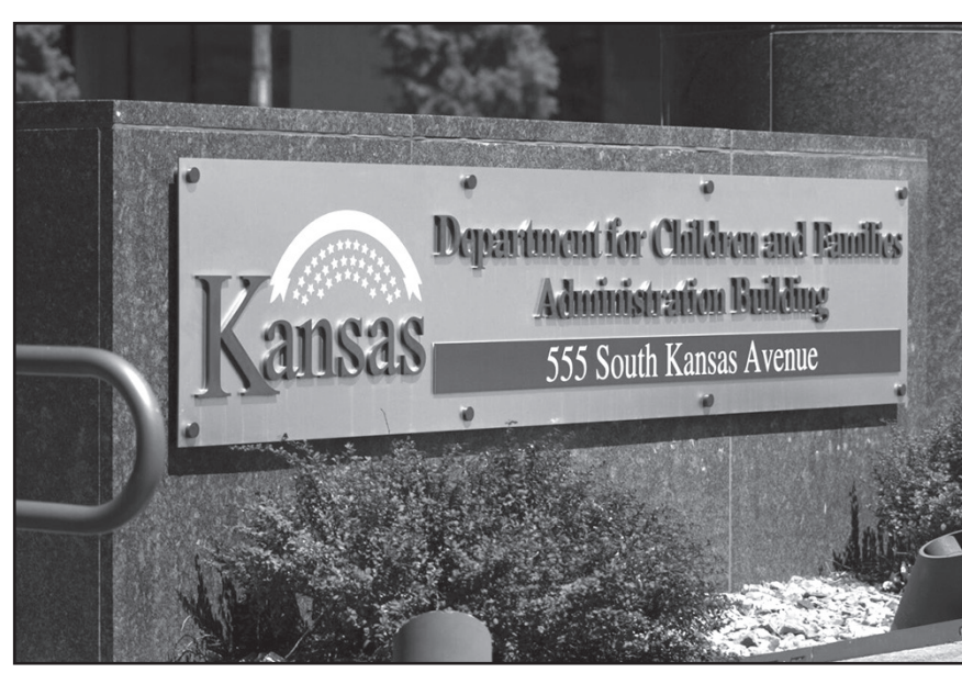
Kansas Department for Children and Families data shows only 3% of eligible Kansas children received summer food assistance through the federal Summer Electronic Benefits Transfer program.

"If systems were integrated and updated, approximately 60,000 more eligible children could be au-