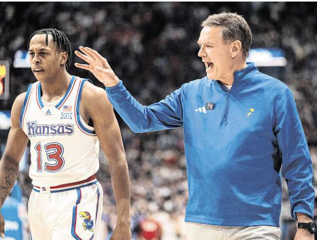
Kansas Jayhawks head coach Bill Self yells out instructions to his team in the second half vs. the UConn Huskies on December 2 at Allen Fieldhouse.