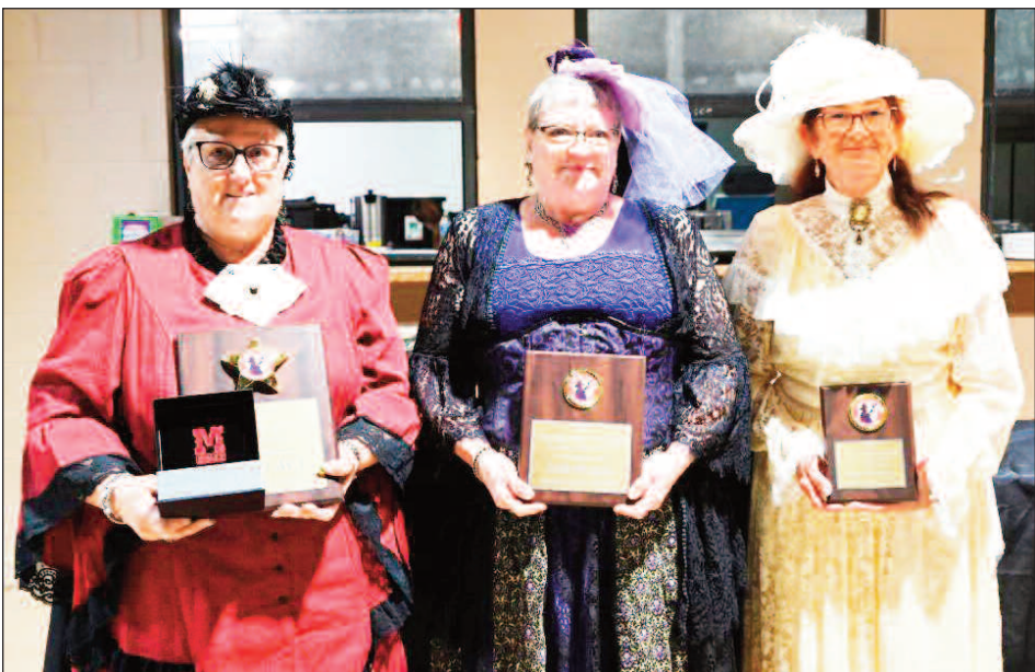
Shady Lady on the left, Kansas Belle in the middle, and 3rd place on the right.

settled Kansas Belle finished 14th and Shady Lady finished in 25th place. Friday night was a night to rest and ready one for the National competition to begin on Saturday.