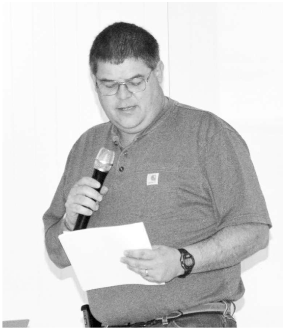
Chamber President reads off a list of upcoming Chamber events during the Chamber Banquet held on Saturday, March 21 at the VFW.