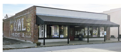
(Building Not For Sale)