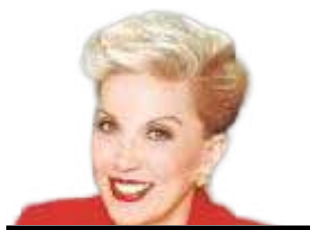
DEAR ABBY Abigail Van Buren