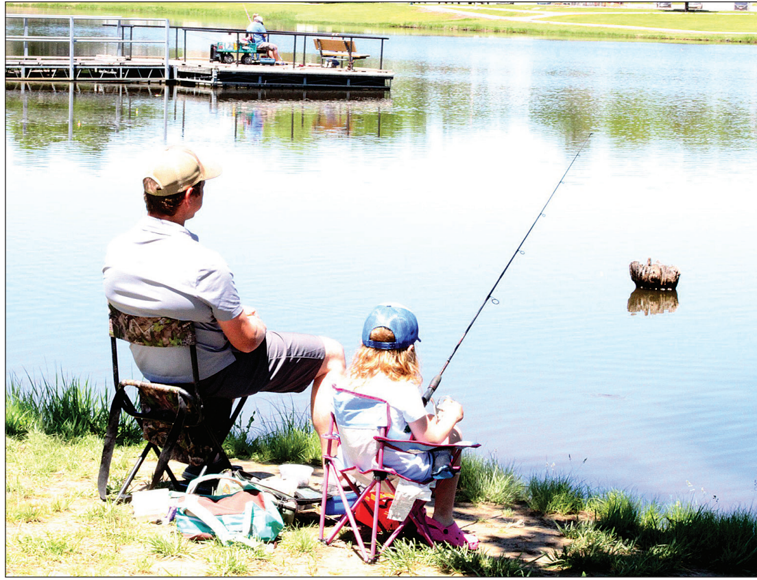
A QUIET SPOT TO FISH — A quiet spot to fish at LeClere Lake might be hard to find this Sunday, as the 33rd annual Youth Fishing Derby will take place. Kiddos of all ages will be vying for prizes and the notoriety of catching the biggest fish of the day.