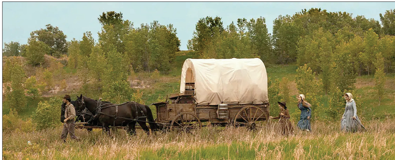
Netflix’s lone teaser thus far of the “Little House on the Prairie” series has been this still image that was released on Netflix’s social media platforms last week. It shows the characters portraying the Ingalls family as they roll through the roughened Kansas landscape in the late 1860s.

The Netflix series has been considered a “reboot” from the television series of the same name that aired on NBC during the 1970s and 1980s. However, unlike the NBC series that