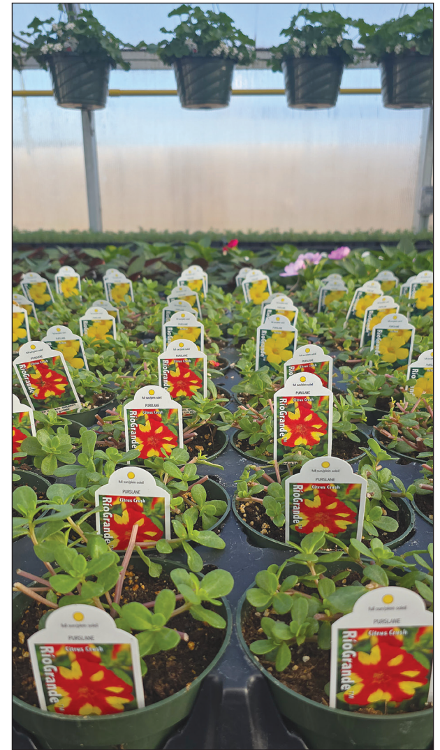
Rows of bedding plants await growth as they sit ready for purchase at the Independence High School FFA program’s Spring Plant Sale.