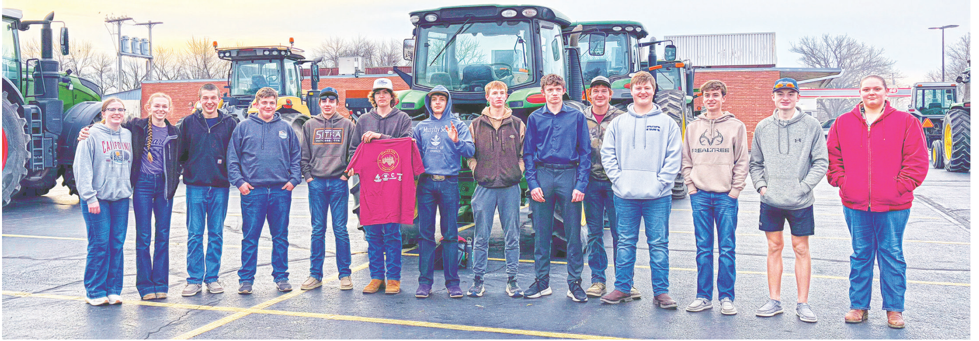
Fourteen GHS FFA members participate in the annual Drive Your Tractor to School Day on Tuesday Feb. 17. Participants had the opportunity to eat breakfast at Murphy Seed before parading to the school in their tractors.